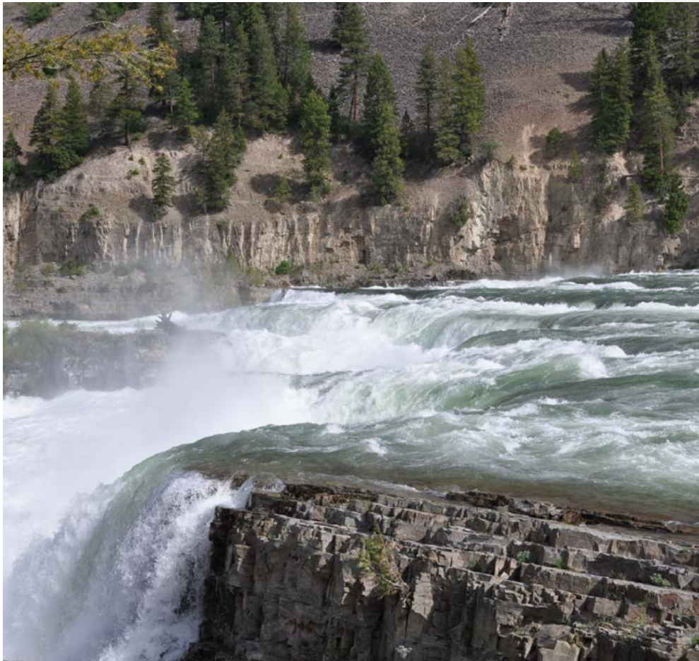
Kootenai Falls May 21, 2013 ~30 kcfs